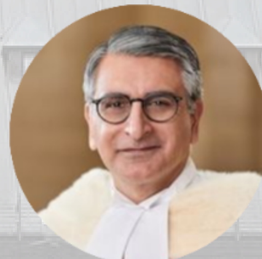
Hon Mahmud Jamal (Supreme Court of Canada)