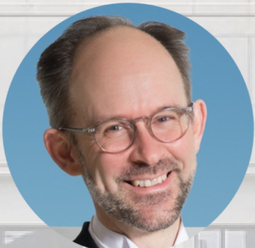
Hon Sébastien Grammond (Federal Court of Canada)